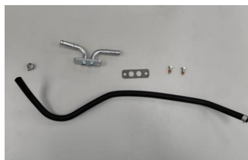
KIT INSIDE BOX