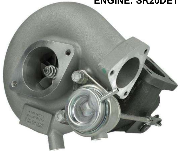
Click image to view more.